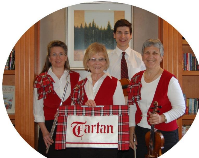
The Tartan Players