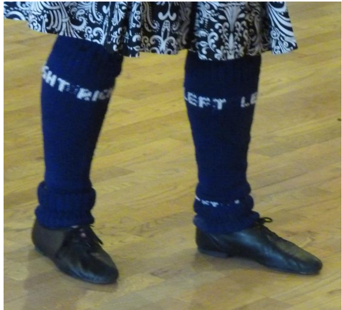
Fiona's leg warmers for the directionally challenged