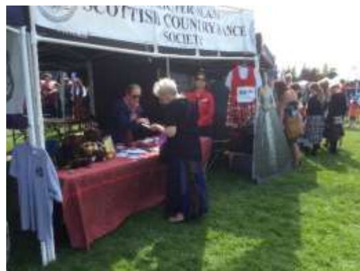
Our information table