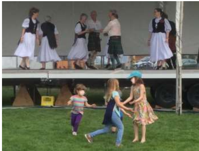
Dem Team, with the next generation of dancers