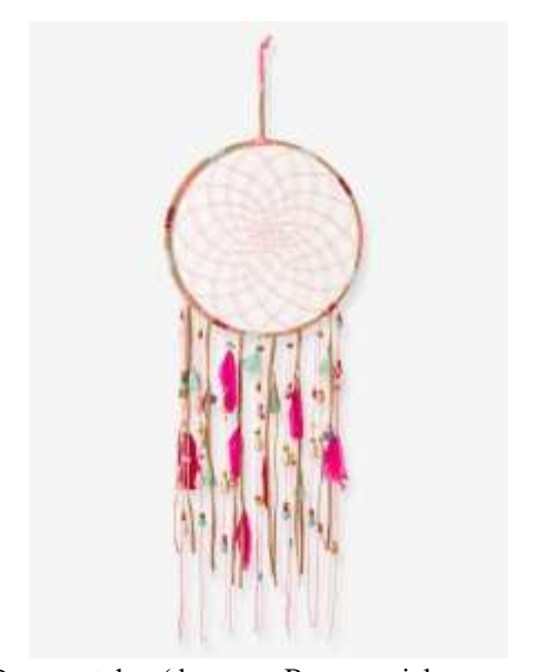
Dreamcatcher (dance on Burns social program)