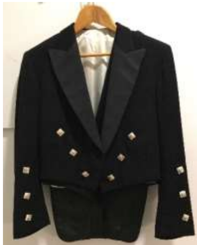
Prince Charlie jacket